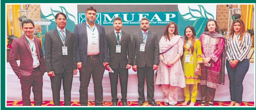
MUFAP Management Team