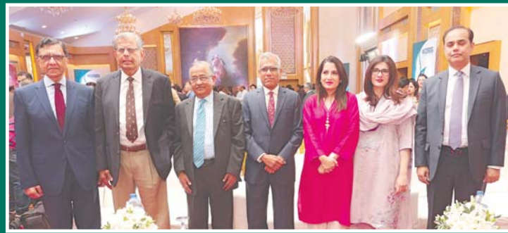
CEO's of member Asset Management Companies